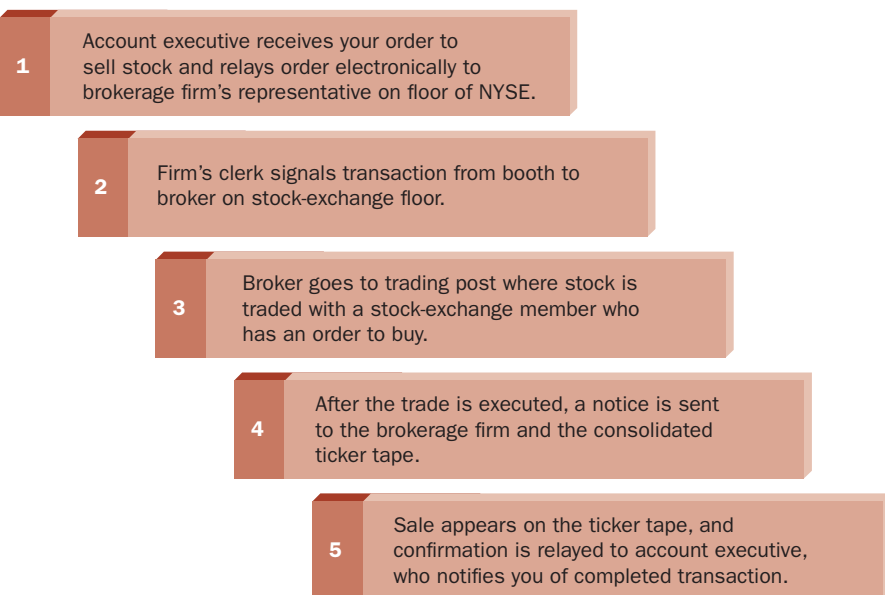
Table 20.2 shows typical commission fees charged by online brokerage firms. Generally, online transactions are less expensive when compared with the costs of trading securities through a full-service brokerage firm. As a rule of thumb, full-service brokerage firms charge as much as 1 to 2 percent of the transaction amount. Commissions for trading bonds, commodities, and options are usually lower than those for trading stocks.

Although not quite a horse race, a typical stock transaction takes only about 20 minutes.